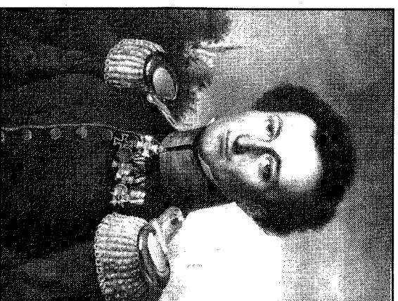
Carl von Clausewitz, the first modern commentator on war strategies. From Mathematics and War .