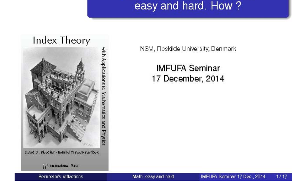
Figure 1. Logo for this paper

Dedication . In respectful memory of Ivor Grattan-Guinness (23 June 1941 - 12 December 2014).